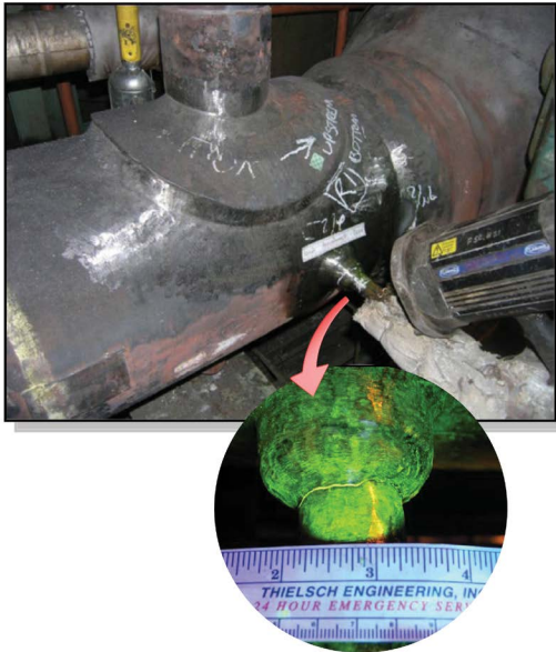
Figure 2. Example of a surface incitations discovered during a routine outage inspection.